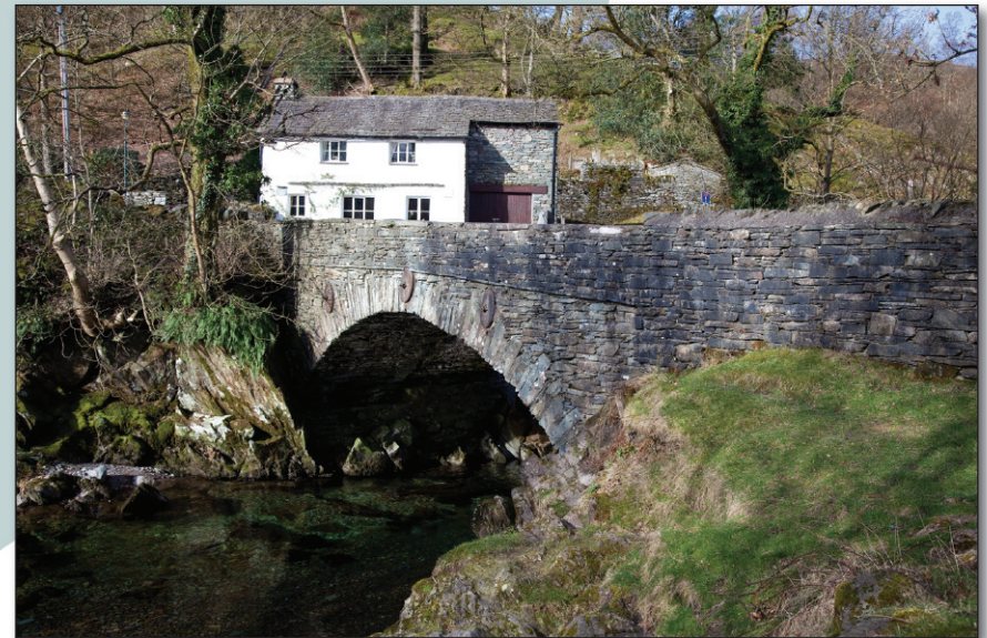
Bridge over Great Langdale Beck, Elterwater