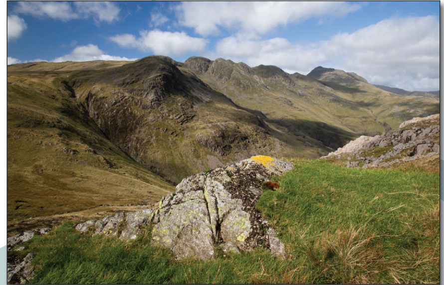
Great Knott, Crinkle Crag and Bowfell from the slopes of Pike of Blisco