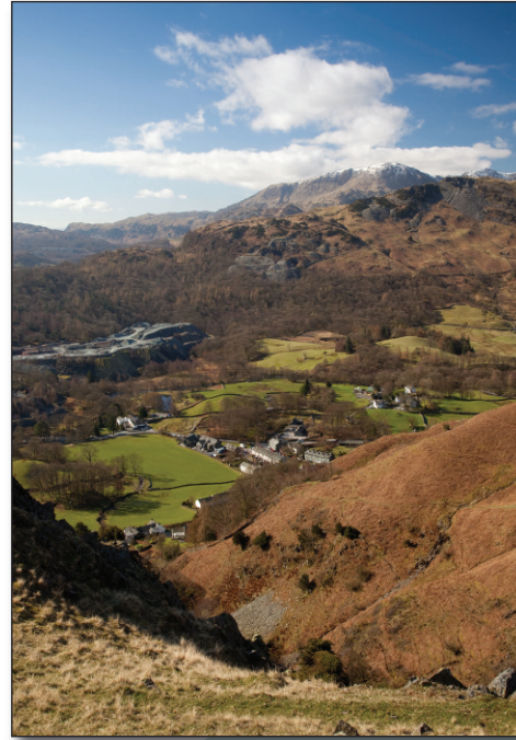
First glimpse of Langdale